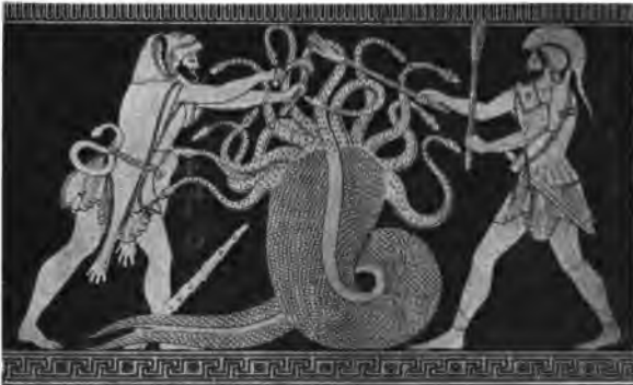
Fig. 67. Heracles killing the Hydra.

used to snatch men and beasts and carry them away. At Athena's suggestion, Heracles aroused these birds with cymbals and then shot them with arrows which he had dipped in the Hydra's poison.